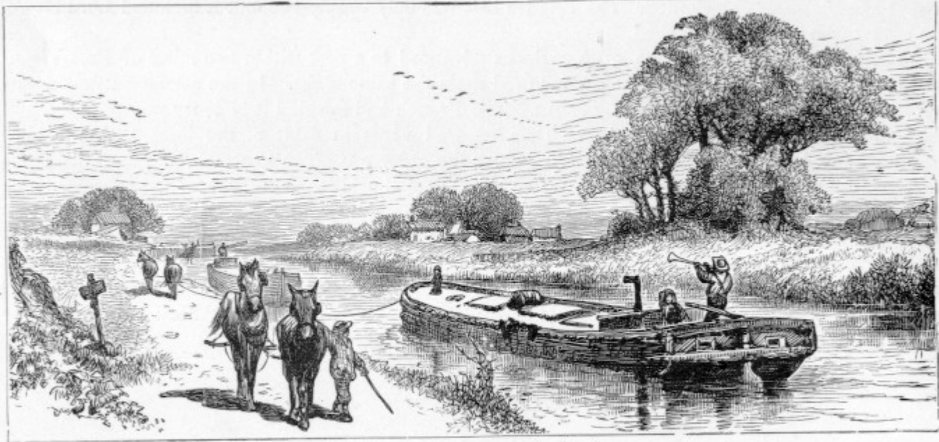
Grain-Boat on the Erie Canal.

Transportation costs from Buffalo to New York City in 1817 when construction began on the Erie Canal were three times the market value of a bushel of wheat and six times that of a bushel of corn. Small wonder that upstate New York commodities were not being shipped in large quantities to New York City!